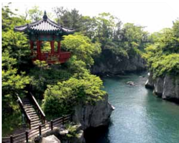
LEFT: Jeju Island