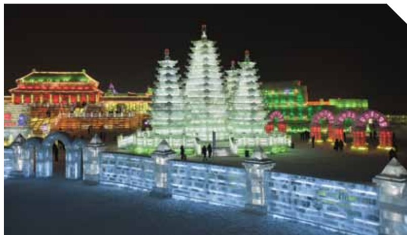
RIGHT: Harbin Ice and Snow Festival

➔ Prices start at £2,499, including VIP door-to-door airport transfers, flights, accommodation, most meals, guiding, tourist visa, travel insurance and portage. The first departure is on November 11. FIND OUT MORE: travel.saga.co.uk