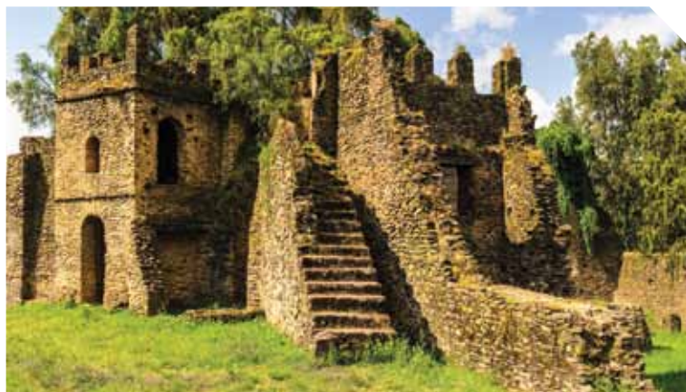
ABOVE: Fasil Ghebbi, Ethiopia

Tourism is still in its infancy in Ethiopia, and sadly for many, the name is still more synonymous