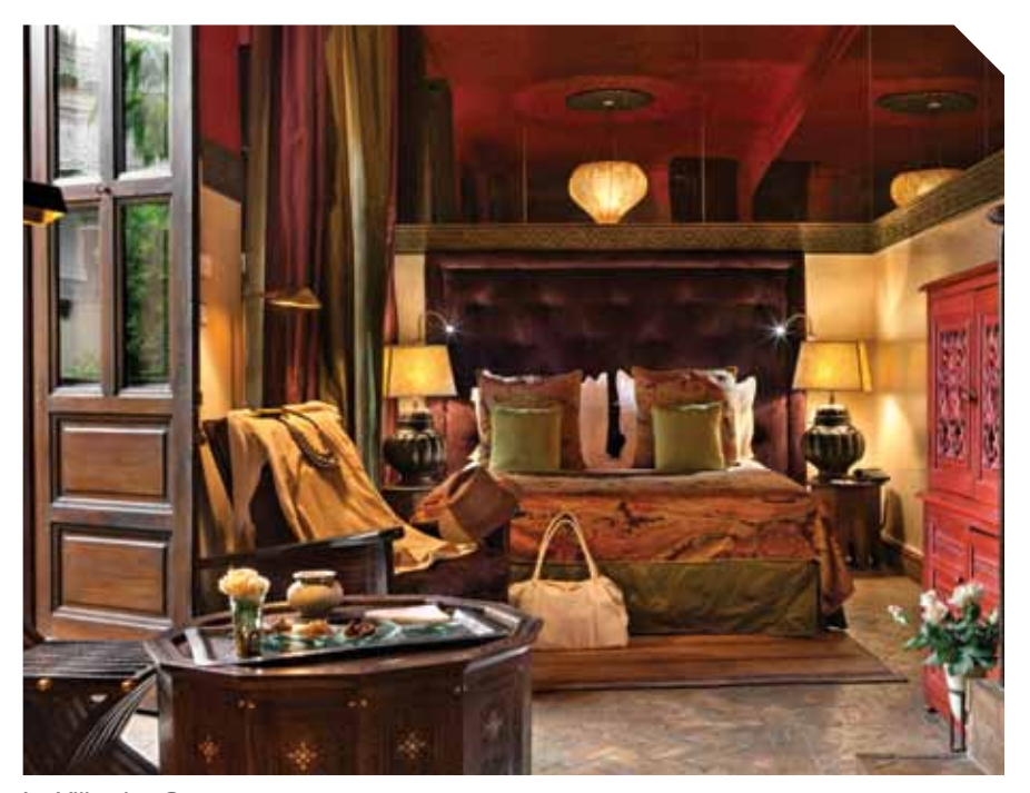
La Villa des Orangers

With so many romantic spots on this list, you might be forgiven for wondering where to send clients who want a rooftop of their very own. That's where this Moroccan riad comes in, offering deluxe rooms and suites with their own private terraces. Not only do they offer unobstructed views across the medina,