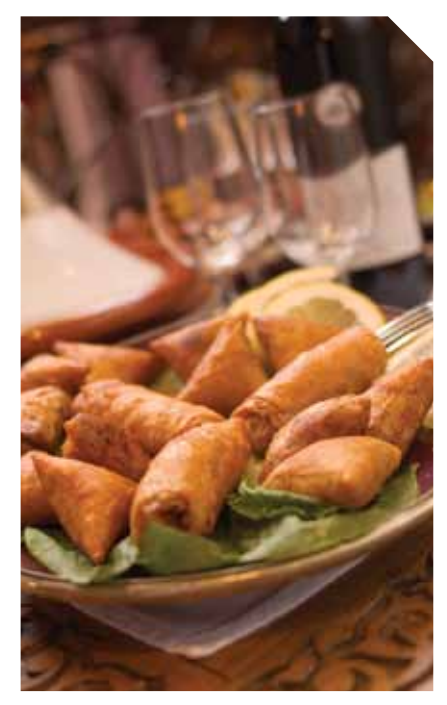
Le Foundouk Restaurant

intimate table for two, but do advise clients to book ahead as the rooftop terrace is always in demand. foundouk.com